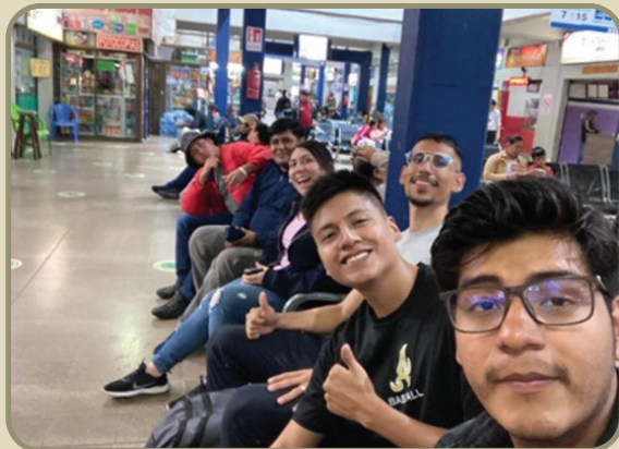
2024 CC3D graduates heading out on their summer practicum.

There are many things I would like to tell. Maybe it would be easier in a conversation than in a letter, but hopefully this helps you know a little of how God is working here in Cochabamba, Bolivia.