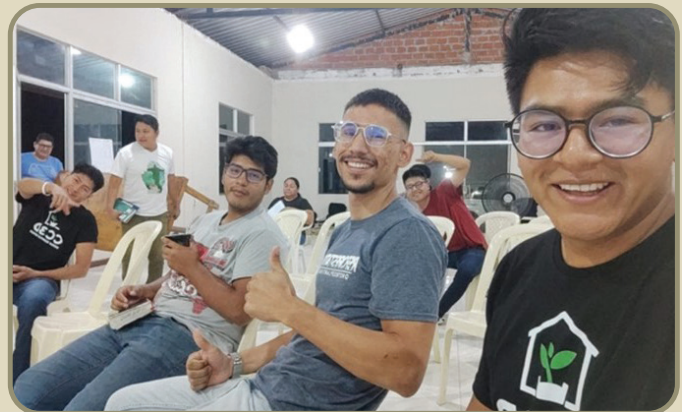
School's not all work and no fun!